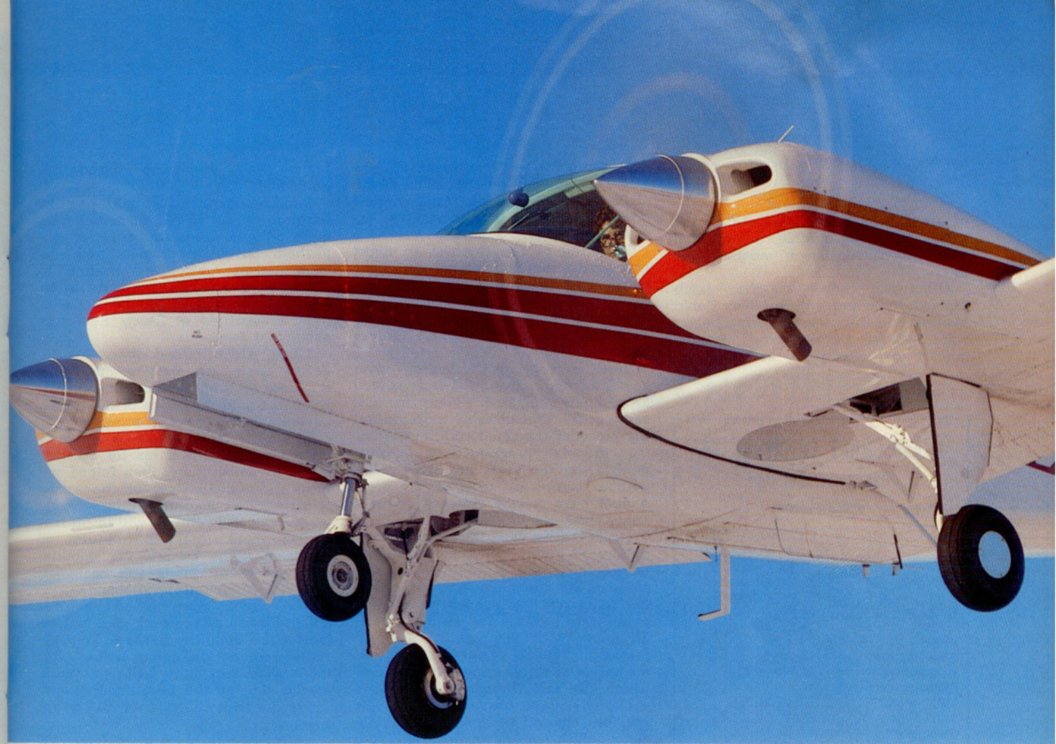
Nose gear pulls forward and mains move in when the T-tailed Duchess goes up.