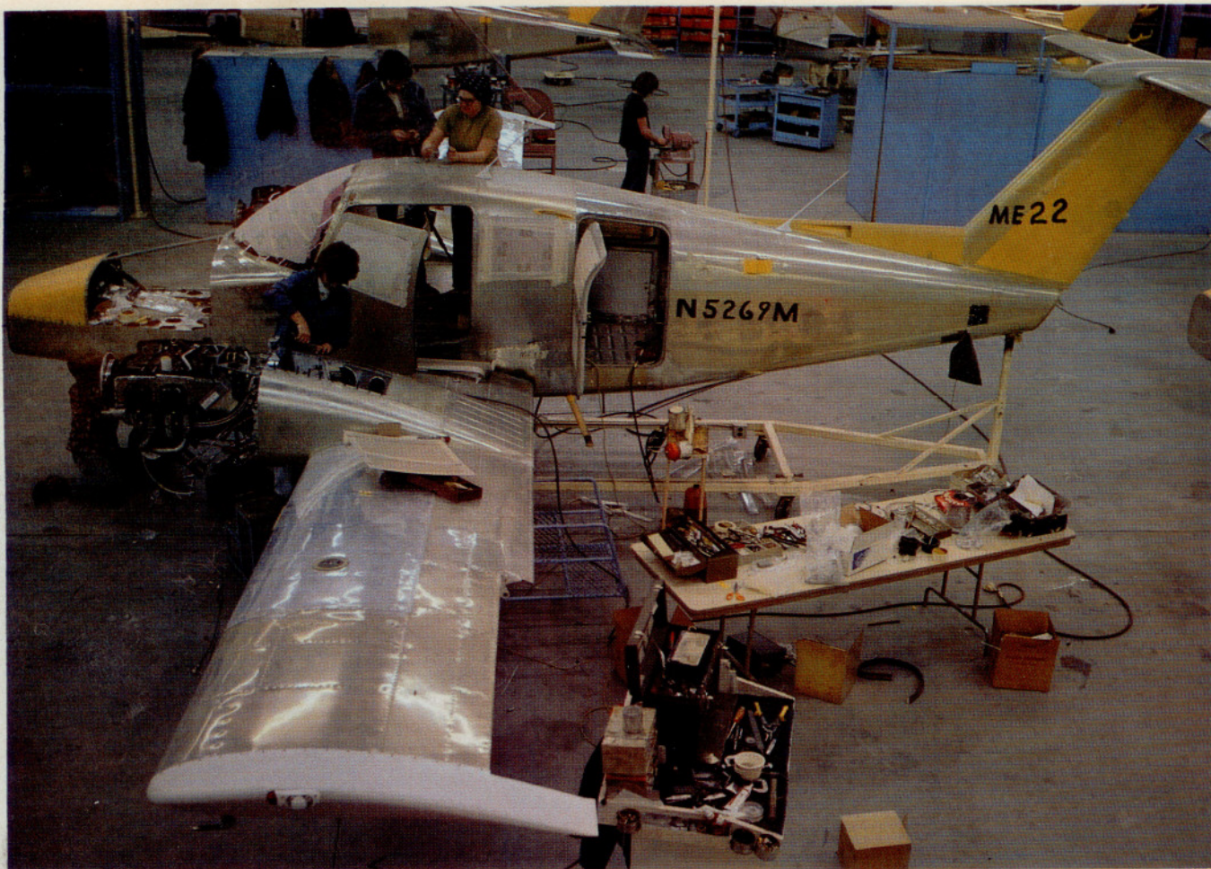
Beech's Liberal, Kan., factory was recently expanded to handle one-a-day Duchess production.

A door for people on each side, plus another door for baggage, makes loading and unloading an easy task.